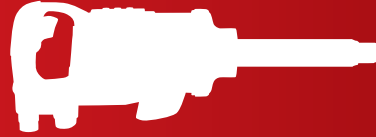
285B-S6 Impactool™ #5 Spline drive includes extended 6" anvil