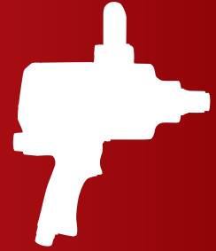
295A Impactool™ 1" Drive