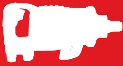
285B Impactool™ 1" Drive